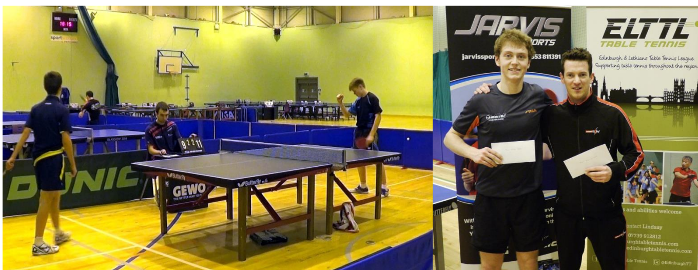
Left - U23s championship point