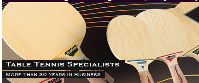
TABLE TENNIS SPECIALISTS

All our products are direct from the manufacturing suppliers so you can guarantee genuine quality when you buy from us.