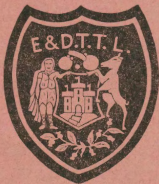
TABLE TENNIS LEAGUE