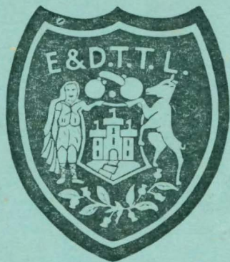
TABLE TENNIS LEAGUE