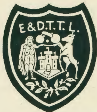
TABLE TENNIS LEAGUE