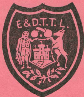
TABLE TENNIS LEAGUE