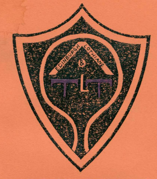
TABLE TENNIS LEAGUE